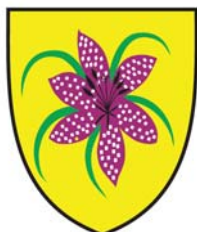
Municipality of Trzin